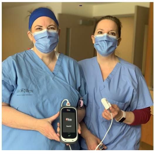
Respiratory Therapists with donorfunded Handheld Oximeter