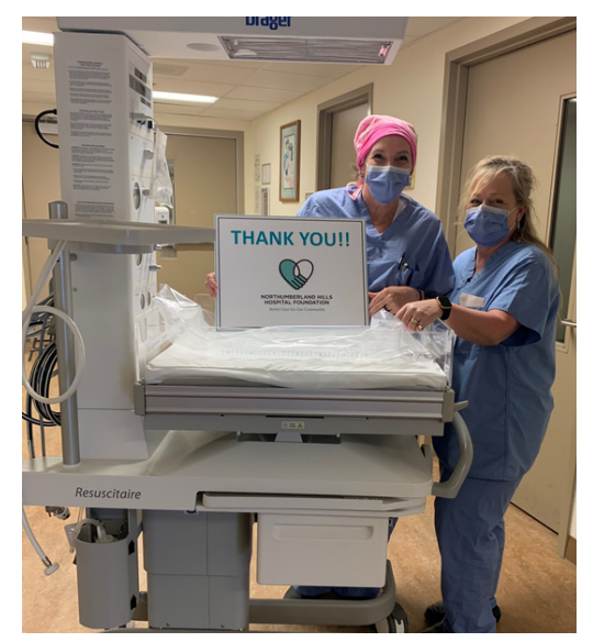
Maternal Child Care Nurses with donorfunded Newborn Radiant Warmer