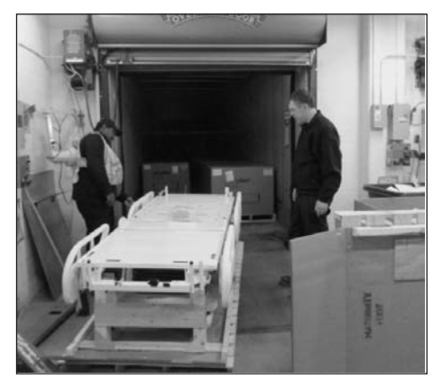
The process of unloading the beds begins.

15 new electric beds were delivered to NHH in March and we were there to take photos!