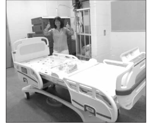
Fully assembled and ready to go!

Generous community support to the Light up a Life Campaign made this possible. Thank you!!