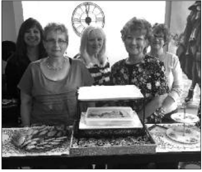
The outstanding staff at Mayfair Salon