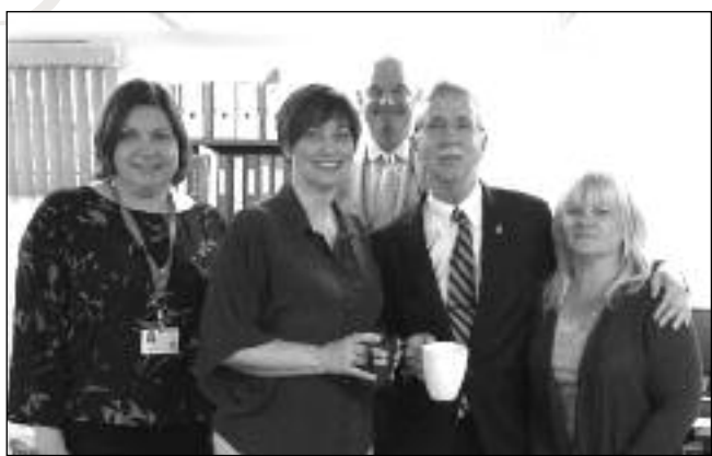
Stadtke Plumbing & Heating and their guests