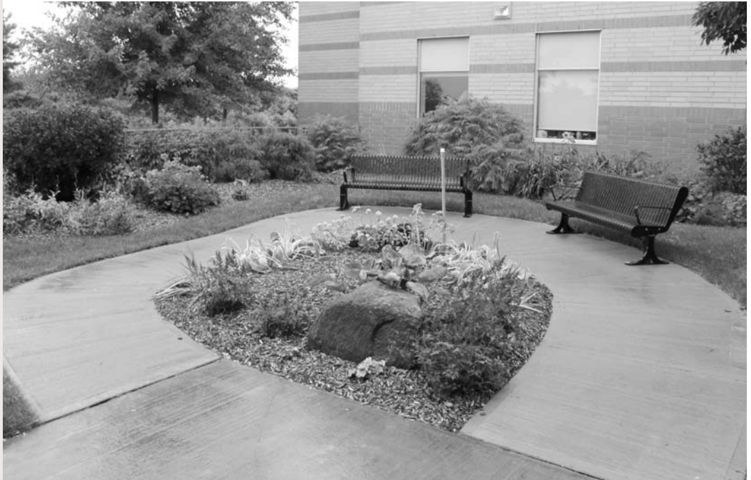
Main portion of “Dorothy’s Way”