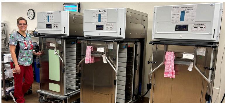
Food Services Worker, Brandy, with three units of new food delivery system

Internal Grants for Minor Equipment $98,005 Mental Health $42,361 Education $167,167